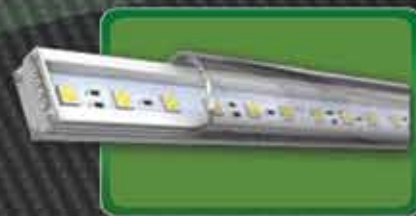
LinkaLED LED Bar