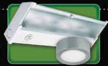
Under Cabinet Cabinet Bars Puck light