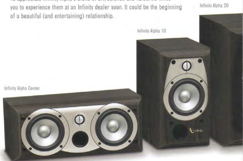
Infinity Alpha 20

In short, Infinity is a leader, not a follower. An acoustic innovator among a throng of me-too manufacturers. Only a company with Infinity's commitment to research, engineering and testing could produce a speaker line as sophisticated as the Infinity Alpha Series.